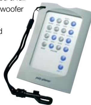
The Poly-Planar® system features a floating remote control.

audio experience that will enhance and complement your spa enjoyment.